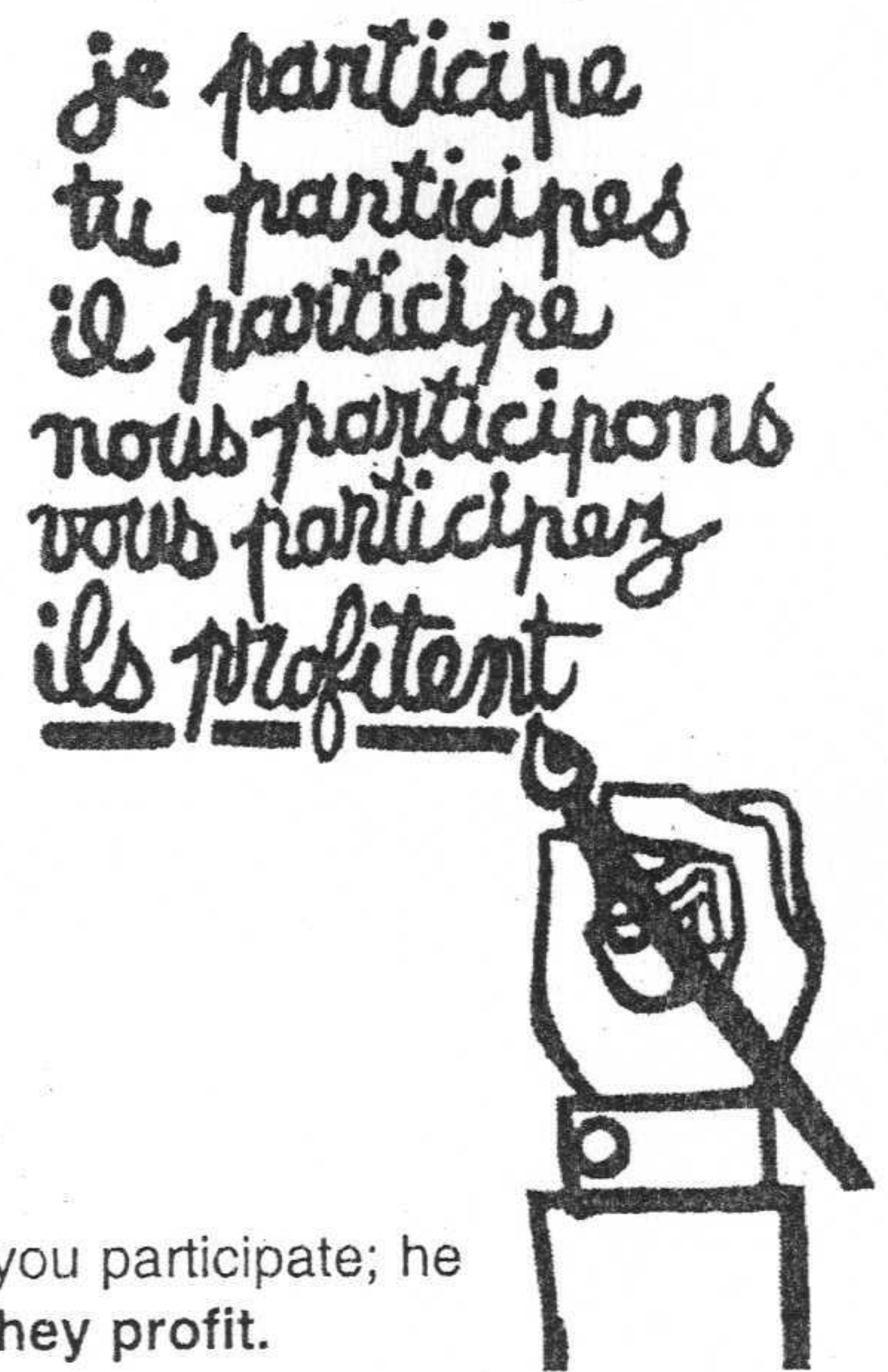
FIGURE 1 French Student Poster. In English, I participate; you participate; he participates; we participate; you participate . . . They profit.

have-not citizens, presently excluded from the political and economic processes, to be deliberately included in the future. It is the strategy by which the have-nots join in determining how information is shared, goals and policies are set, tax resources are allocated, programs are operated, and benefits like contracts and patronage are parceled out. In short, it is the means by which they can induce significant social reform which enables them to share in the benefits of the affluent society.