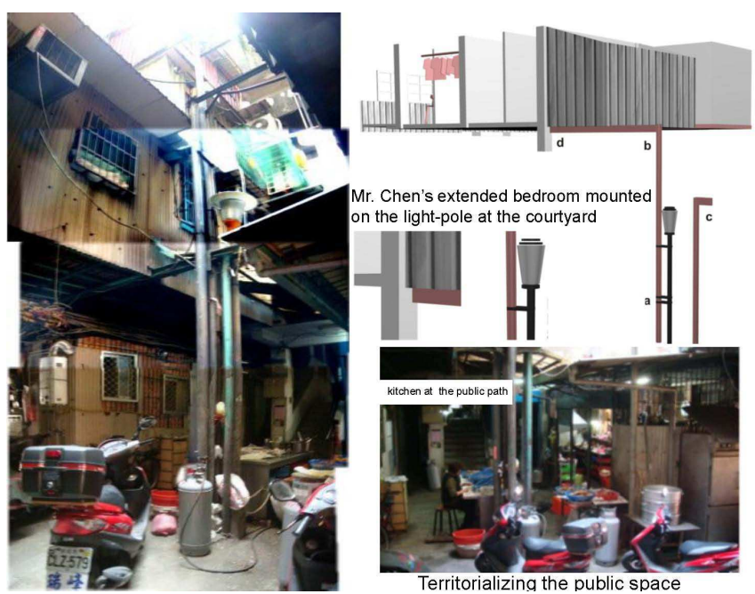
Figure 5 Metal-sheet rooms mounting on the pole trunk at the center of the designated public domain.

In many pre-modern villages before the intervention of planning, the 'public' path evolves out of the setback of building blocks rather than pre-determines the layout of the physical space. The western concept of the public sometimes claims a legitimacy which demarcates spatial hierarchy and order under the manipulations of dictating powers while the time-dependent process of collective living induces a negotiated order out of chaos through the dynamics of territorialization, de-territorialization, and re-territorialization. What is marked as a public building or space is usually operated under strict guidelines and regulations, yet the threshold of the public domain is not well respected by the informal city (in this respect, is a public space with an administrative threshold truly public?). Though the layouts of phase II and phase III of the South Airport Apartment are drastically different from the first phase plan, the public-private contention of space is similar. The 'transitional' space from private to public or vice versa is therefore most expressive of the collective fear and desire of the informal city.