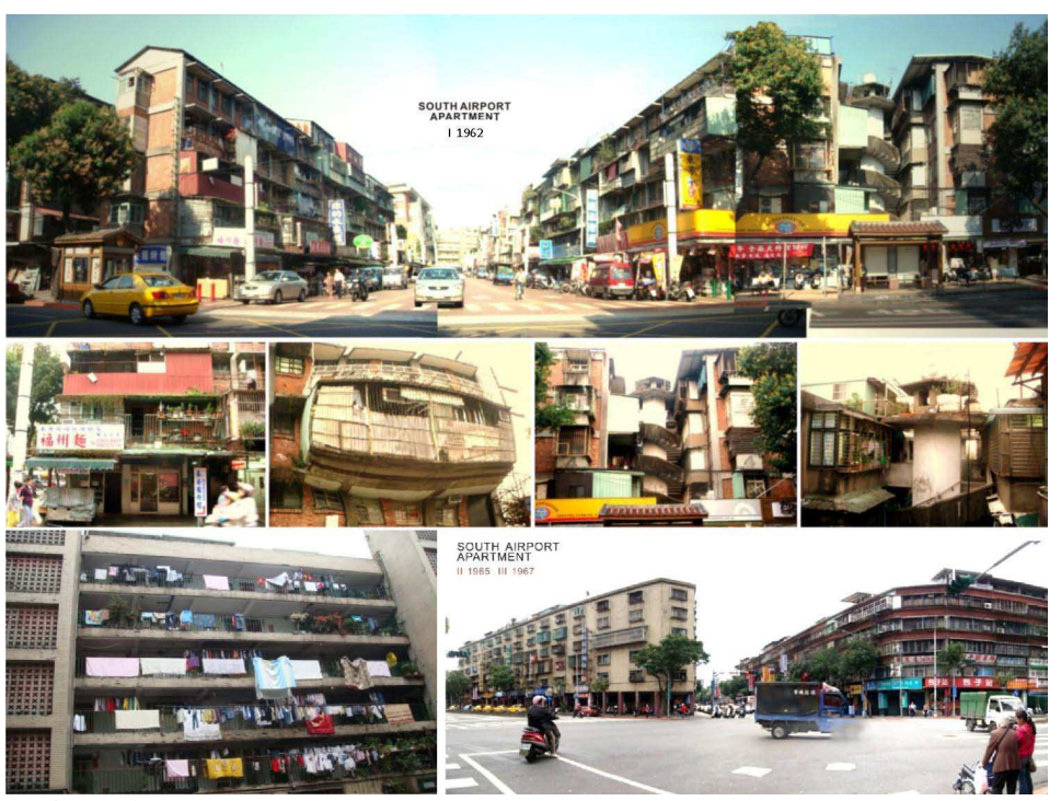
Figure 1 Images of the three-phase developments of the South Airport Apartment

Erected in 1962 as one of the first housing projects of Taiwan, the extant South Airport Apartment is symbolic yet aged. It accommodates all walks of life and a wide variety of immigrant backgrounds within small individual units of 26.4m². Except for the toilet and kitchen, all the other family functions are crammed into the same compartment. All together 2972 units in 11 rows of 5-story reinforced-brick blocks (phase I) and two courtyard compounds (phase II & III) make up the socially colorful community (including veterans families, rural immigrants families, single-parent families, single senile-citizen households, local shrines, markets, a huge night market, and so on) at the southwest corner of the city. Connected by spiral and 'scissors' stairways between two adjacent buildings, the appearance of the phase I South Airport Apartment still looks unique today (Fig. 1). Local residents nickname the public stairway 'the flying corkscrew' as an identifiable landmark whose void column also serves ingeniously as a garbage collector.