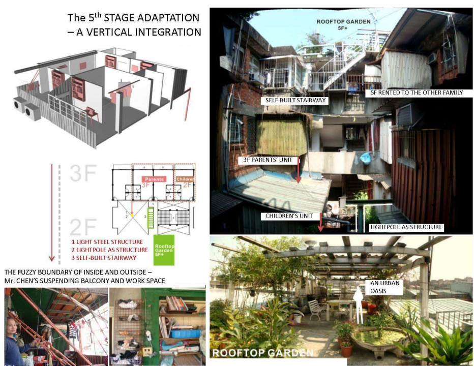
Figure 4 The vertical integration of Mr. Chen's informal expansion.

The rooftop of the walk-up flat is supposed to be shared by all residents downstairs, but the top-floor unit can easily monopolize the space by blocking the stairway or building an extra shelter to prevent sub-tropical heat and claim private domain all at once. In the real estate trade of Taipei, the top-floor apartment can become more marketable when the rooftop floor area is counted as 'usable' space (for instance, the agency will specify 'registered floor area' and 'usable floor area' for such sale items). The phenomenon fades out quickly in the elevator high-rises, largely due to a different system of subdivision layout and the stationing of a management unit in most high-rises. The continuous skyline of colorful rooftop metal-box additions above the 4- or 5-story apartments is an unmistakable image of Taipei, but Mr. Chen demonstrates an alternative of privatizing and greening rooftop. Informalization can be innovative.