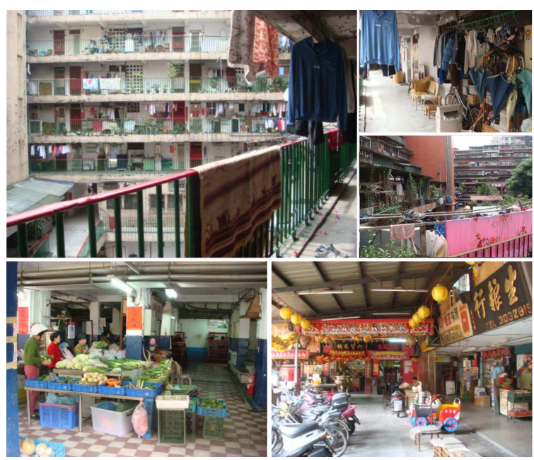
Figure 6 Transitional spaces between private sphere and public domain in the phase II and phase III of the South Airport Apartment.

Around the edge of the central court at the lower level of the phase III Apartment, small Taoist altars mingle with market stalls and grocery stores and exude a low-key plaza ambiance. These 'apartment shrines' are unregistered and excluded by land-use zoning, however, they play crucial roles in the community's worldly as well as spiritual life along their daily-life routes. Without the prestige of a holy temple or the metaphysical wisdom of Buddhist belief, these altars reflect the mundane values of an immigrant society. Superstition aside, their constant rituals are regarded as nuisance in contemporary urban environment. Yet senile and retired residents always enjoy hanging out with neighbors at the openings around the altars, sitting on the extra chairs donated by various families and drinking many rounds of tea. These transitional areas where private tugs with public are comparable to urban tidal zone that consists of many uncharted habitats for different species. In contrast, the central court is often devoid of human activities.